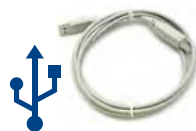
USB cable (Included)

The BMP®51 printer connects to your PC via the included USB cable. To avoid use of a physical cable, optional field-installable network cards are also available: