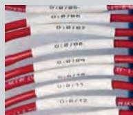
PermaSleeve® wire marking sleeves