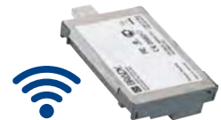
WiFi only card required if printing from mobile apps (Catalog#: NET-WIFI)