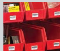
General ID ...and much more!