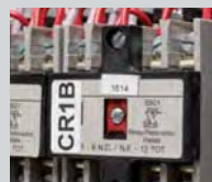
Panel component identification