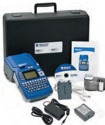
(Catalog# BMP51 shown)

Patents applied for: 6,732,619 and 7,070,347 on printer. 6,929,415 on the PermaSleeve® cartridges. 8,542,155 on wireless and ethernet cards.