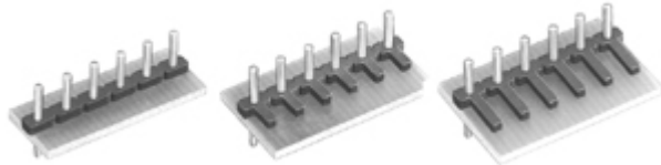
971-SLK, 971-SLS, 971-SLW