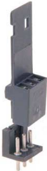
One possible variation of assembly