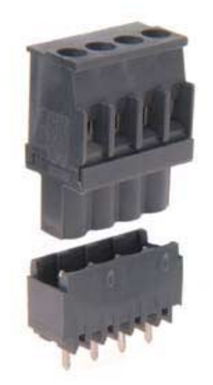
One possible variation of assembly