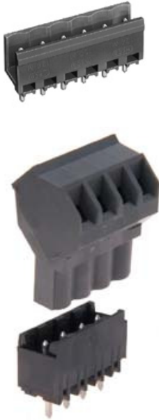
One possible variation of assembly

Product Number: 121-M-121/09 Plug-in Screw Connector System for Printed Circuit Boards 0.2 in. spacing - 2 to 24 poles