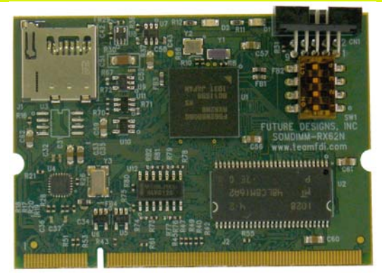
Actual PCB dimensions are 2.66" x 1.89"