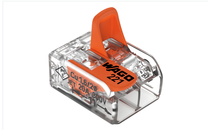
\hbox{Color:} \ \square \ \hbox{transparent}