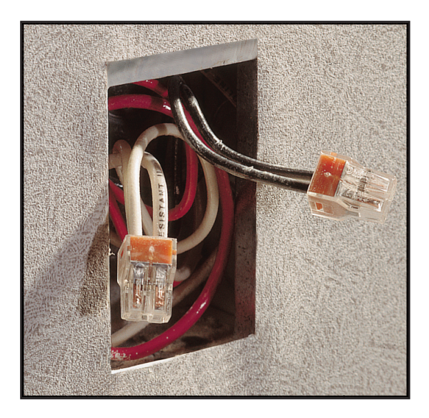
WALL-NUTS<sup>™</sup> are perfect for new construction and retrofit work.

WALL-NUTS<sup>™</sup> hold each wire individually, eliminating loose connections. WALL-NUTS<sup>™</sup> are touch-proof and rated to 105° C. WALL-NUTS<sup>™</sup> are UL Listed/CSA certified for 600 volts (1000 volts for fixtures and signs) and current rated to the largest conductor used.