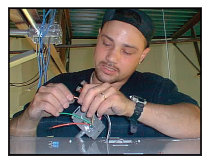
WALL-NUTS<sup>™</sup> work with solid and stranded wire making main, branch and fixture hookup fast, easy and safe.