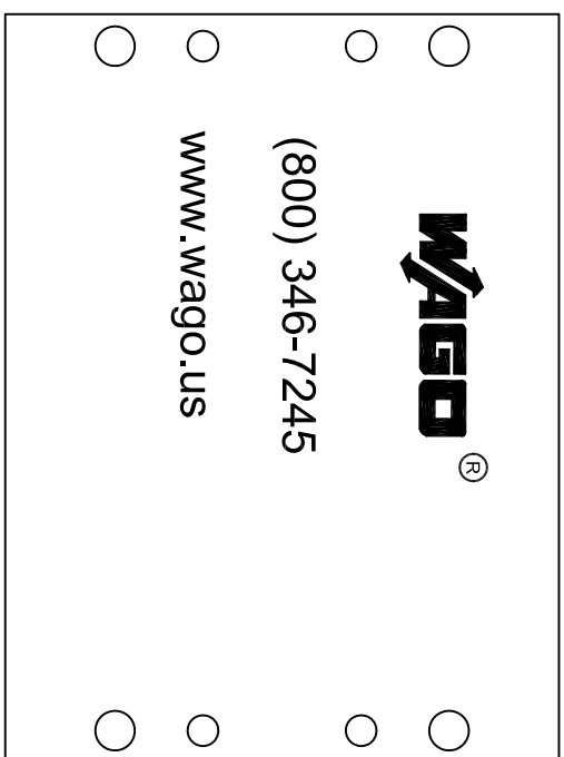
BOTTOM SIDE VIEW WHITE SILKSCREEN AS SHOWN