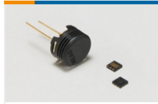
Humidity Sensor Components(20)