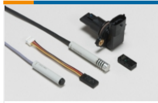
Humidity Sensor Assemblies(2)