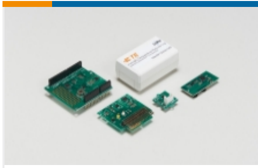
Digital Component Sensors(2)