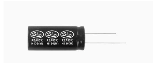
Sleeve & Marking Color: Blue & Black