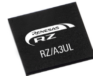
361-pin, 13x13mm PBGA (0.5mm pitch)

The RZ/A3UL delivers significant performance, including the highest operating frequency of 1GHz and the ability to connect to high-speed DDR3L/DDR4 RAM. In addition to its high-performance features, RZ/A3UL is an entry-class device providing a cost-effective solution for HMI, IoT Gateway, and audio equipment.