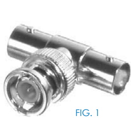
FIG. 1 RFB-1130, -1

DIELECTRIC: D - DELRIN PE - POLYETHYLENE T - TEFLON