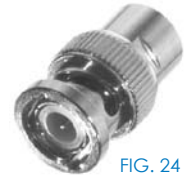
FIG. 24 RFE-6102