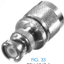
FIG. 33 RFN-1040-1