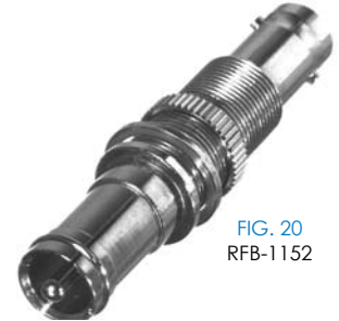
FIG. 20 RFB-1152