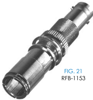
FIG. 21 RFB-1153