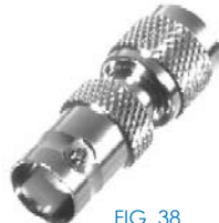
FIG. 38 RFU-622