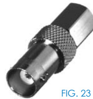
FIG. 23 RFE-6101