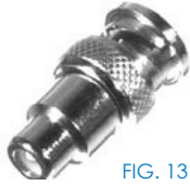
FIG. 13 RFB-1139