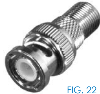
FIG. 22 RFB-1155