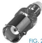
FIG. 26 RFE-6150