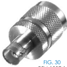
FIG. 30 RFN-1037-1