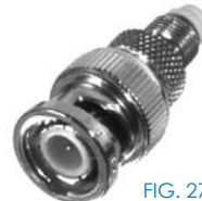
FIG. 27 RFE-6151