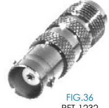
FIG. 36 RFT-1232