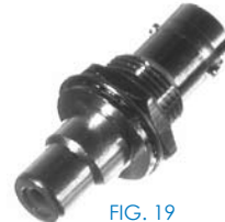
FIG. 19 RFB-1151