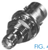
FIG. 41 RSA-3413-3