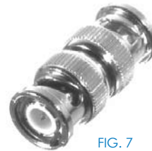
FIG. 7 RFB-1133