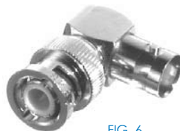
FIG. 6 RFB-1132