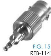
FIG. 15 RFB-1141