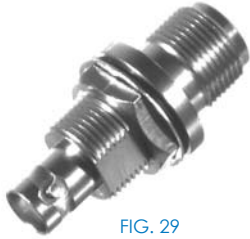
FIG. 29 RFN-1023-5