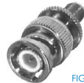
FIG. 44 RSA-3476, -1

PHOTOS FOR REFERENCE ONLY, SHOWN AT 100% ACTUAL SIZE.