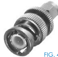
FIG. 43 RSA-3459