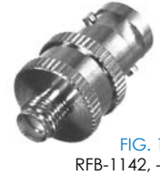
FIG. 16 RFB-1142, -4, -5, -6