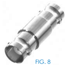
FIG. 8 RFB-1134