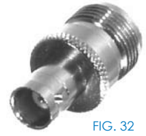
FIG. 32 RFN-1039-1