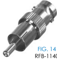
FIG. 14 RFB-1140