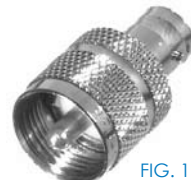
FIG. 11 RFB-1137