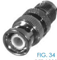
FIG. 34 RFT-1230