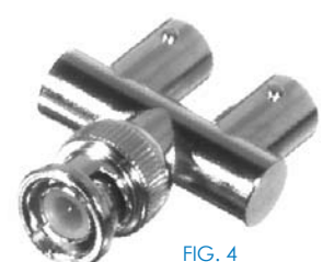
FIG. 4 RFB-1130-5