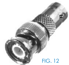
FIG. 12 RFB-1138