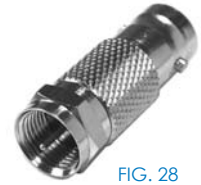
FIG. 28 RFF-1479

PHOTOS FOR REFERENCE ONLY, SHOWN AT 100% ACTUAL SIZE.