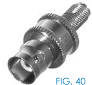
FIG. 40 RSA-3413