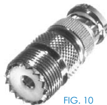
FIG. 10 RFB-1136