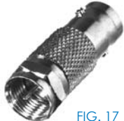
FIG. 17 RFB-1144