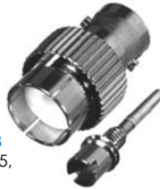
FIG. 18 RFB-1145,