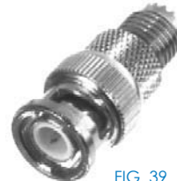
FIG. 39 RFU-627