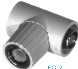
FIG. 2 RFB-1130-2