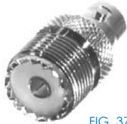
FIG. 37 RFU-545