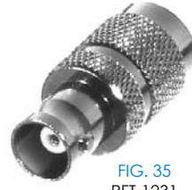
FIG. 35 RFT-1231