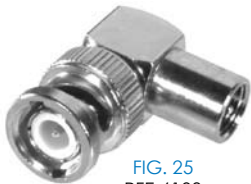
FIG. 25 RFE-6103