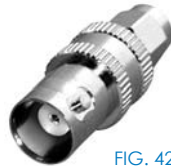
FIG. 42 RSA-3458