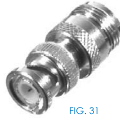
FIG. 31 RFN-1038-1