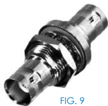
FIG. 9 RFB-1135, -, -T