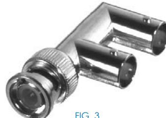
FIG. 3 RFB-1130-3