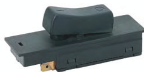
Basic type 1257