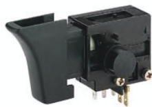
Basic type 1299