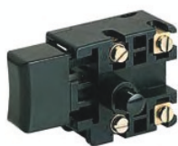
Basic type 1281