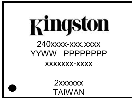
Figure 4 - EMMC Package Marking