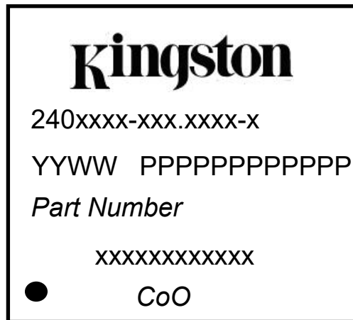
Figure 4 - EMMC Package Marking