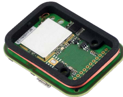
TWN4 MultiTech 3 BLE PCB bottom view

The new TWN4 MultiTech 3 BLE integrates RFID (125 kHz, 134.2 kHz and 13.56 MHz), NFC and Bluetooth Low Energy capabilities into a compact but powerful reader. Its reduced size combined with excellent read/write performance makes it the perfect reader for all applications where small size and full performance matters, e.g. print solutions, healthcare applications, driver identification, POS integration and much more. Furthermore, the TWN4 MultiTech 3 BLE provides access to most common host interfaces such as USB, serial (TTL) or I2C which are readily accessible through an on-board connector.