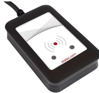
Desktop version (inlay customizable)

Elatec's TWN4 family of transponder readers and writers allows users to read and write to almost any 125 kHz, 134.2 kHz and 13.56 MHz tags and/or labels. It supports all major transponders from various suppliers like ATMEL, EM, ST, NXP, TI, HID etc. and ISO standards like ISO14443A/B (T=CL), ISO15693, ISO18092 / ECMA-340 (NFC).