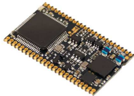
Version C0 (SMT) 31 x 17.8 x 2.7 mm