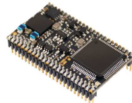
Version C1 (THT) 31 x 17.8 x 8.11 mm

Elatec's TWN4 family of transponder readers and writers allows users to read and write to almost any 125 kHz and 13.56 MHz tags and/or labels – it supports all major transponders from various suppliers like ATMEL, EM, ST, NXP, TI, HID, LEGIC, etc. and ISO standards like ISO14443A/B (T=CL), ISO15693, ISO18092 / ECMA-340 (NFC).