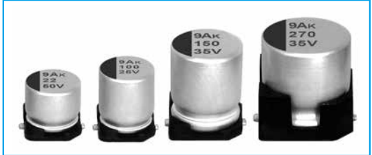
Marking color : Blue print