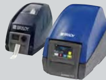
NEW BradyPrinter i5100 and legacy IP™ Printer

The following pages contain 3" core label rolls that are designed for use in these printers unless otherwise noted.