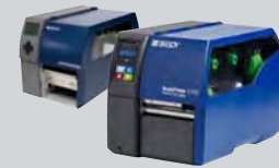
NEW BradyPrinter i7100 and legacy PR PLUS printer