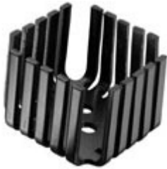
Representative Photo Only