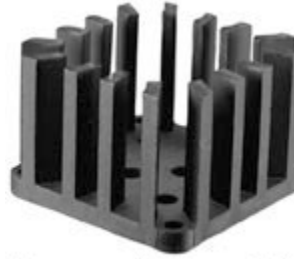
Representative Photo Only